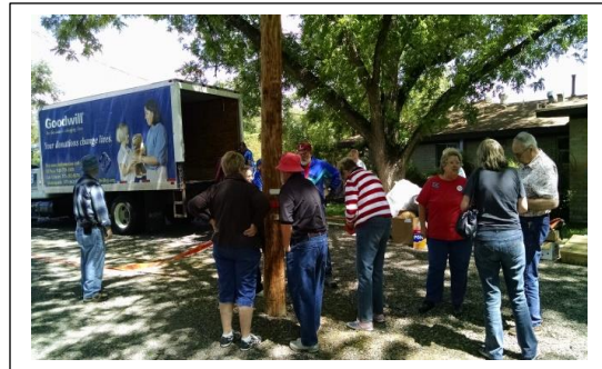
All the chapter volunteers helped to pack up unsold items and loaded them onto the Goodwill Truck.