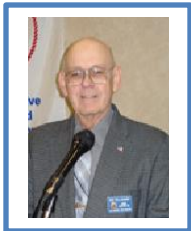
Chapter 182 President

Join us at our General Meeting at our New Location – September 12 th – Important Legislative Program !