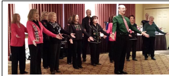
The New Desert Harmony Singers performed a medley of wonderful songs at our December meeting. This group makes a difference in people's lives through the art of music.