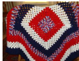
ALZHEIMER'S RAFFLE MAY MEETING