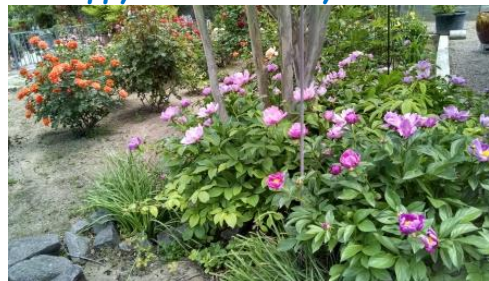
Beautiful flowers bloom in the Willoughby's yard.