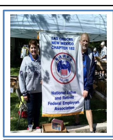
YARD SALE MAY 5 8 a.m.