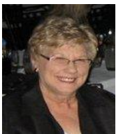
Chapter President And NM Federation President

Local Web Site: http://www.narfe-nm.net/ch0182/ch0182.html