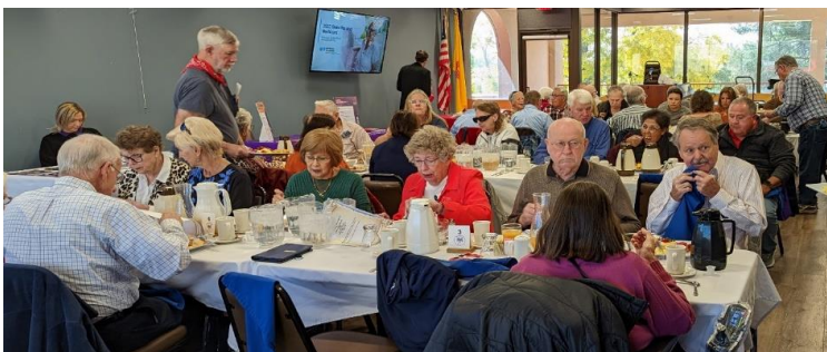
Chapter members enjoying their breakfast at our November 2022 chapter meeting!