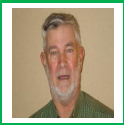
VP for Membership & Chapter Historian