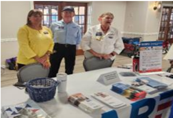
Photo from Que Pasa Event at White Sands Missile Range on Sep 10, 2025.

Please contact, rosco631@gmail.com or 575-635-7127, for more information.