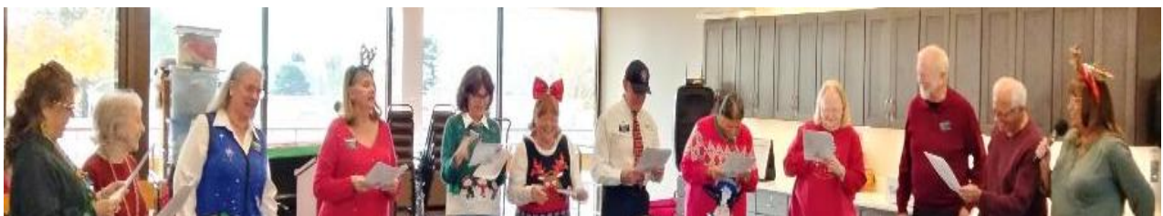
Members singing The Twelve Days of Christmas at our December 2025 meeting!