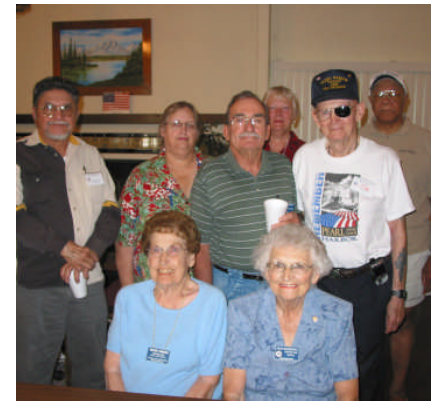
2008 Chapter 1462 Meeting photo (Front row — second from left)