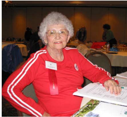
2006 Farmington at the NM Federation of Chapters Convention